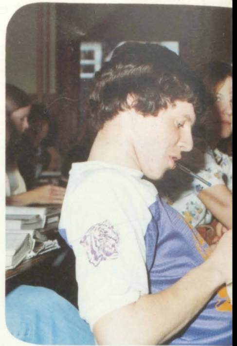
Sophomore History class.